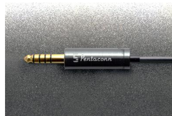
Nippon DICS Company's gold plated non-oxidized copper 5-pole balanced plug